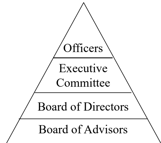
Proposed Depiction of “Target” Structure

Note: Slides that follow assume this motion is adopted.